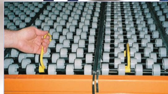
Easy to position lane indexers also available