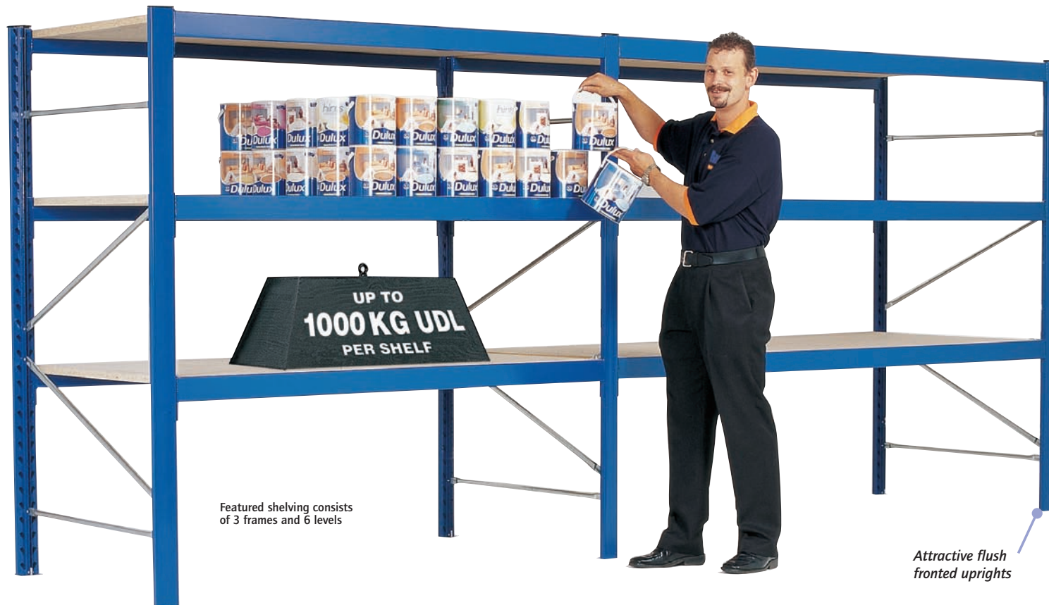
Featured shelving consists of 3 frames and 6 levels