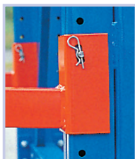
Arms have simple locking mechanism