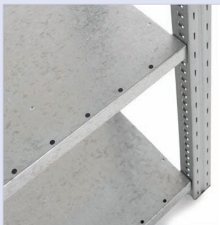
Quick and easy assembly. Shelves are simple to install and adjust