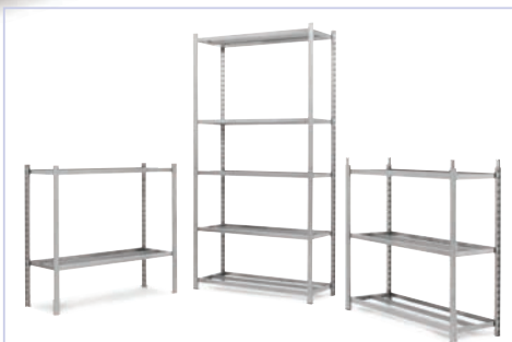
Split uprights - allow assembly of tall and short bays

NB. We recommend 3 levels are positioned below the upright connectors