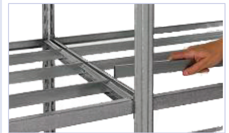
Tubular shelves are easy to assemble