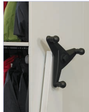
Mechanically assisted hand wheel system