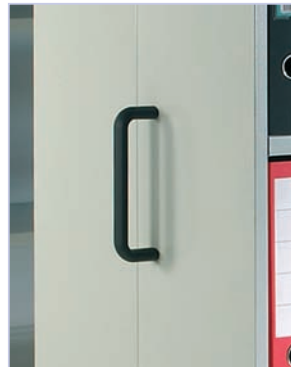
Hand operated push/pull system