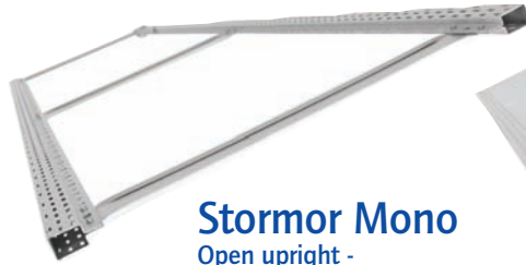
Stormor Mono Open upright - for visibility and ventilation

Stormor is a leading shelving system for medium duty applications. With a choice of three upright styles and a wide range of accessories, Stormor shelving is the ideal choice in every workplace environment.