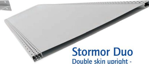
Stormor Duo Double skin upright - 100% access