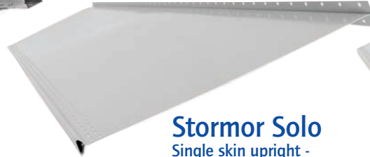
Stormor Solo Single skin upright - open or closed back