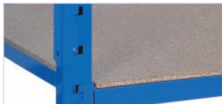
Optional 8mm chipboard covers available for storing smaller items