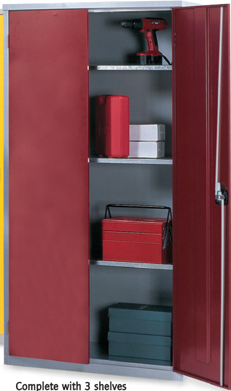
Complete with 3 shelves