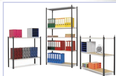
Split uprights - allow assembly of tall and short bays

NB. We recommend 3 levels are positioned below the upright connectors