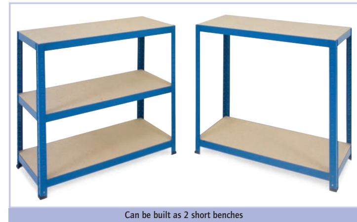
Can be built as 2 short benches