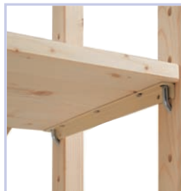
Shelf weight application makes the fixing more rigid.